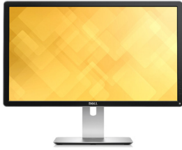
Dell 24 Ultra HD 4K Monitor | P2415Q