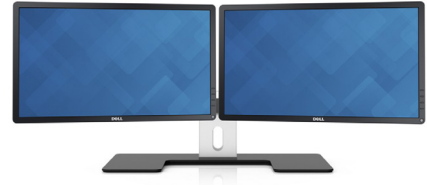
Dell Dual Monitor Stand