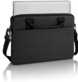
Dell EcoLoop Pro Sleeve (S) - CV5423 (13/14" models)

Eco-friendly and dependable sleeve to keep your laptop securely protected on the go.