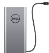
Notebook Power Bank Plus – USB C, 65Wh - PW7018LC

Multiport adapter with integrated speakerphone offers an all-in-one connectivity and conferencing solution.