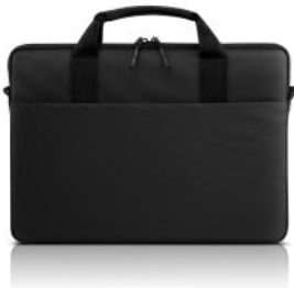
Dell EcoLoop Pro Sleeve (L) - CV5623 (15" models)

Eco-friendly and dependable sleeve to keep your laptop securely protected on the go.