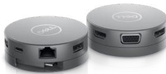
Dell USB-C Mobile Adapter - DA310

Travel light while making a positive impact on the environment by selecting the compact, eco-friendly Dell Premier Slim Backpack 15 (PE1520PS) with EVA foam cushioning to protect your laptop from impact.