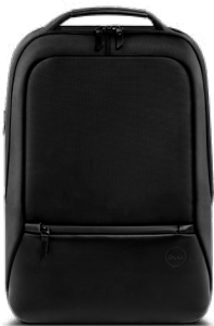
Dell Premier Slim Backpack 15 - PE1520PS

Active Pen with a Tile location tracker providing long battery life on a single charge.