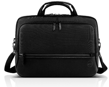
Dell Premier Briefcase 15 - PE1520C

Eco-friendly and dependable sleeve to keep your laptop securely protected on the go.