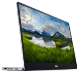
14" Portable Monitor - C1422H

Multi-task seamlessly across 3 devices with this premium full-size keyboard and sculpted mouse combo featuring programmable shortcuts and 36 months battery life. 42