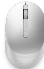
Dell Premier Rechargeable Wireless Mouse - MS7421W

Compact and portable 7-in-1 USB-C mobile adapter provides superb video, data connectivity and up to 90W power pass-through to your PC.