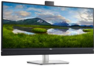
34" Curved Video Conferencing Monitor - C3422WE

Bring your meetings to life on this 34-inch curved WQHD monitor with an integrated IR camera, dual 5W speakers and a dedicated, one-touch Teams button.