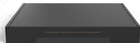
New 100% recycled or renewable packaging 11 Easy to open, uses less carbon to ship.

Most innovative use of bio-based & recycled materials in 14" and 15" premium commercial laptops , in specific parts with up to 39% in bottom bumpers, up to 50% recycled plastic in the battery frame, up to 35% in the palm rest and up to 18% recycled carbon fiber in select lids 18 .