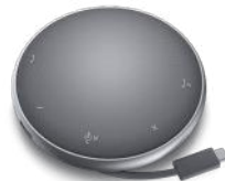
Dell Speakerphone with Multiport Adapter

Experience dual-screen productivity anywhere with Dell's first-ever 14" portable monitor.