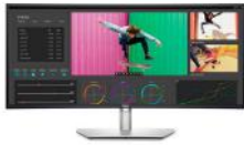
Dell UltraSharp 34 Curved USB-C Hub Monitor - U3421WE

Get immersive productivity on a 34" WQHD curved monitor with a wide color coverage and extensive connectivity including RJ45, USB-C and quick-access front ports.